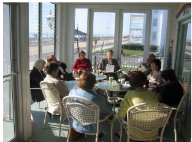
The Spring 2005 A.P.P.L.E. Board meeting

Remember! A.P.P.L.E. is made up entirely of volunteers. There are no administrative salary obligations, and that makes ours a unique organization among nonprofits.