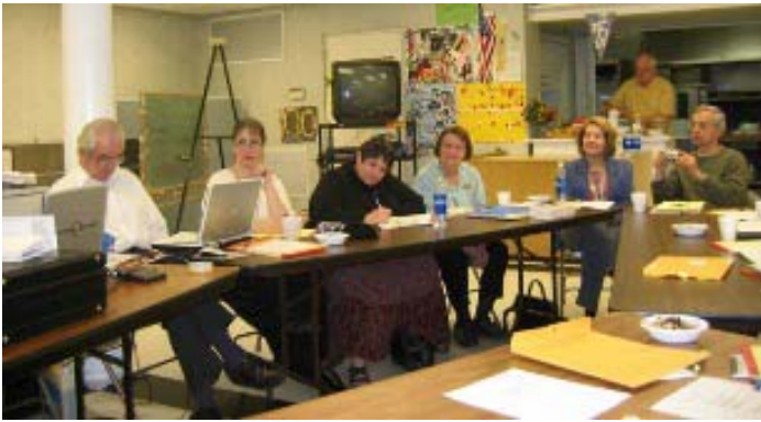
A planning session

road with thoughtful and collaborative decision-making in order to provide quality Education for All.