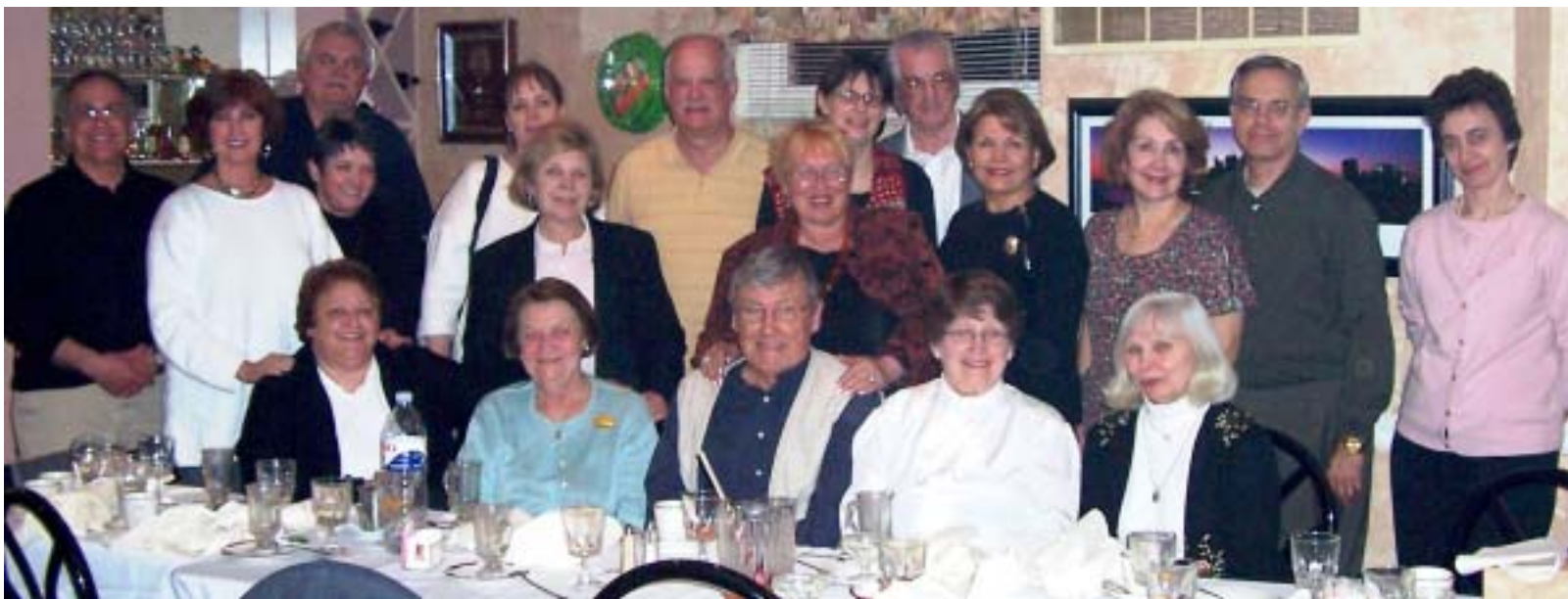
Attendees at the Spring 2005 meeting