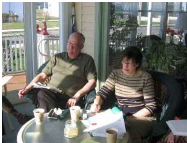
A moment of reflection